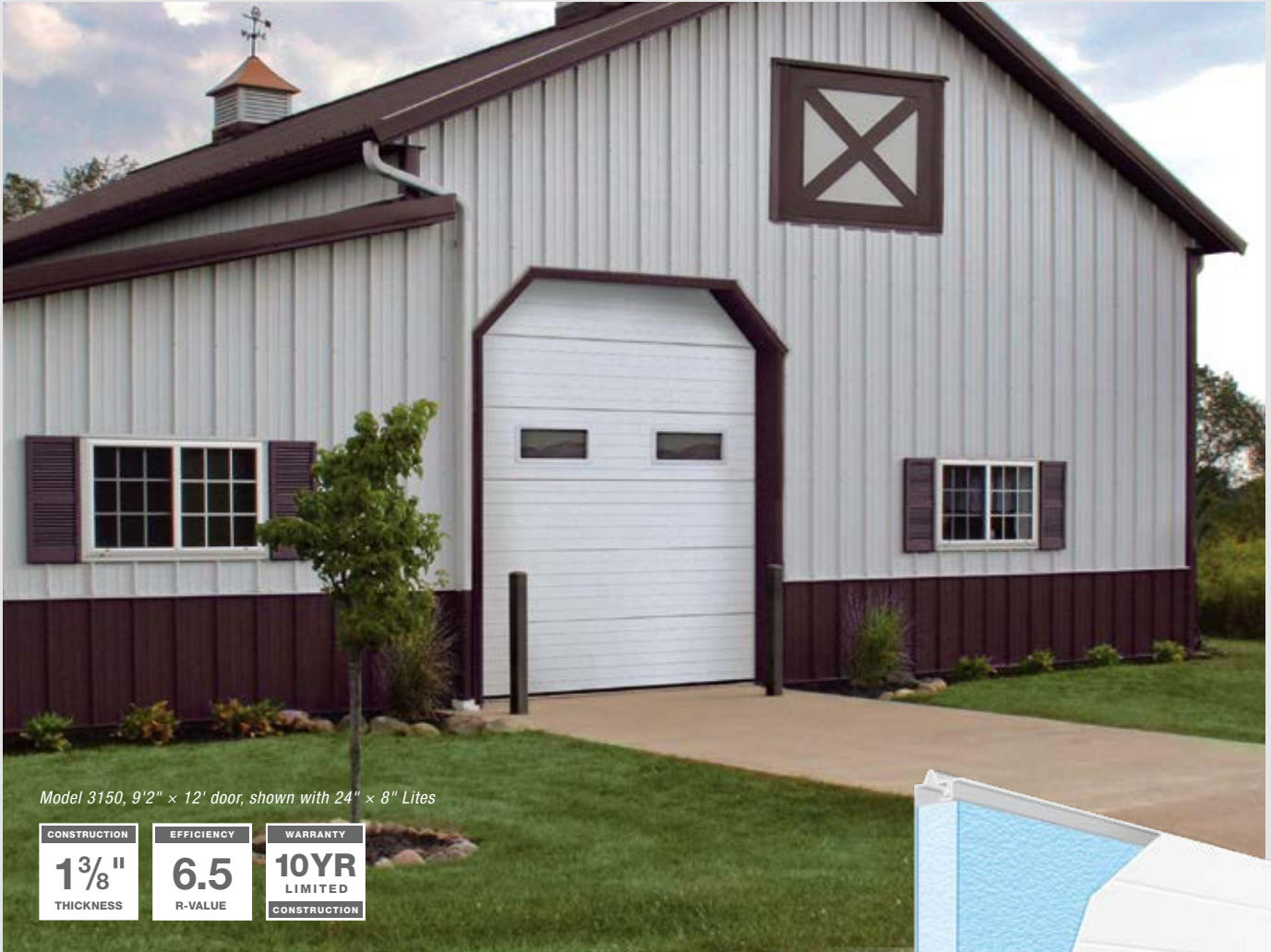
Model 3150, 9'2" x 12' door, shown with 24" x 8" Lites